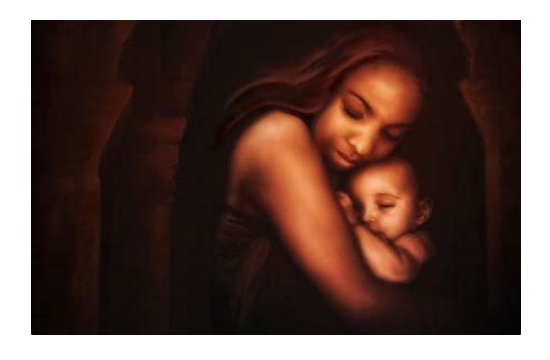
Pregnant and Worried? We want to Help!